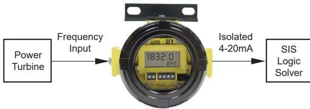
Figure 2. Turbine Over Speed Protection System